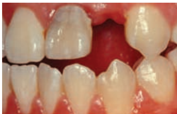
Figure 1: Sports-related dental injuries are usually permanent, disfiguring and involve a lifetime of maintenance.

This is especially the case in so-called 'elite' athletes for whom sport is either their main source of income or plays a significant role in their everyday lives. According to a paper published by the International Olympic Committee in 2000 it would appear, however, that the sporting community has often ignored the role that dentistry and oral health may play in allowing athletes to compete at their optimal level. The authors concluded that 'It is our firm belief that many athletes are unable to maintain proper dental health due to financial restrictions, availability or both. This is reflected in the tremendous demand for dental care of a non-urgent nature at Olympic Games and other major championships.' Specific concerns were oral cancer caused by chewing tobacco, a habit that is popular with many athletes, dental caries resulting from sport drinks, wisdom teeth making jaws of young athletes more susceptible to fracture during competition and last but not least the role of mouthguards in reducing brain concussions by absorbing harmful forces.