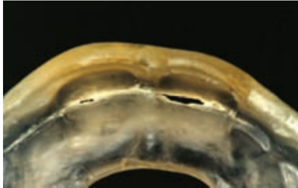
Figure 4: Custom-made mouthguards made from a single layer of ethyl vinyl acetate (EVA) are often extremely thin over the incisal edges as in this case where the teeth have actually bitten through the material that is supposed to be protecting them.