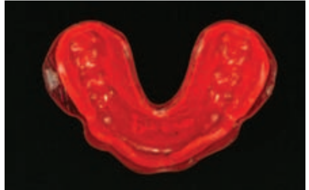
Figure 5: Vacuum forming is incapable of bonding layers of EVA together and mouthguards thus formed will often delaminate.

face lifetime dental costs of US$10,000–15,000 per tooth, many hours in the dental chair, and may develop other dental problems such as periodontal disease. Similarly, it has been shown that the treatment of maxillofacial and dental injuries account for over 13% of the costs of all football injuries (Sane and Ylipaavalnimei 1988)