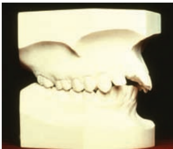
Figure 2: Increased overjets increase the likelihood of dental injury.

excessive use of potentially harmful (to teeth) sports drinks (Tahmassebi 2004). Research conducted by Mintel in 2005 noted that the consumer's quest for a healthier lifestyle continues to drive demand for sports drinks and supplements and accordingly, sports drink sales are expected to grow across all age groups.